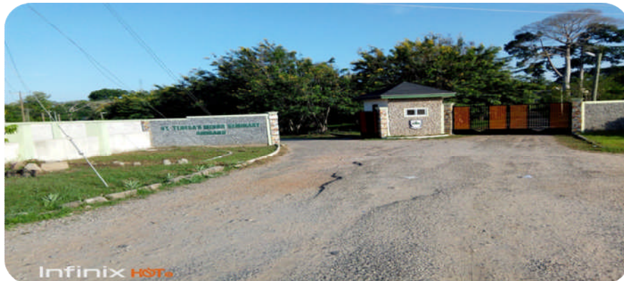
ST. THERESA'S MINOR SEMINARY MAIN GATE