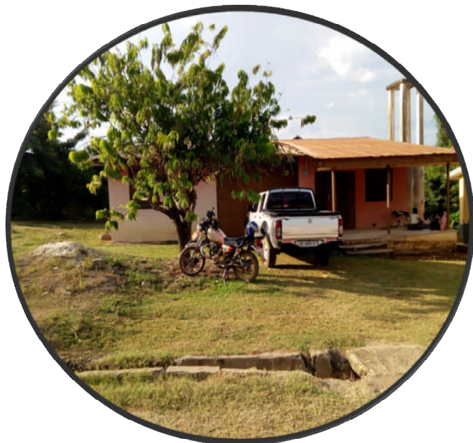
KIM OFOASE CLINIC