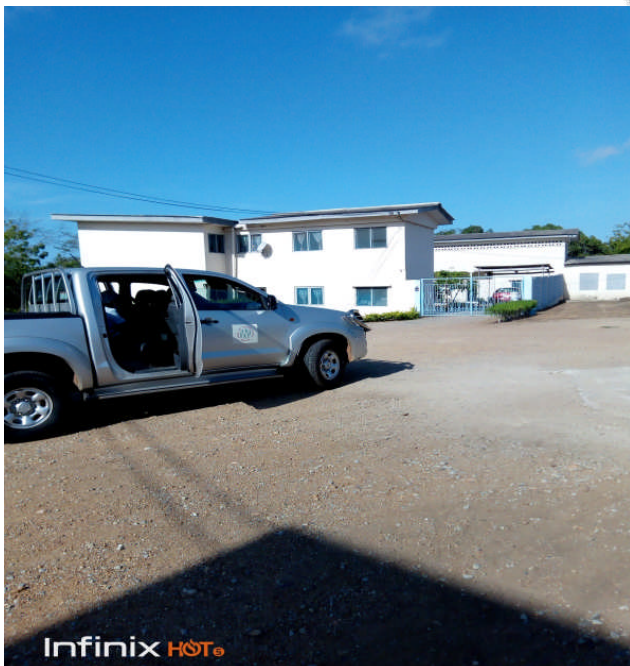
THE INFANT JESUS FORMATION HOUSE, WHERE SOME OF OUR SISTERS LIVED TO