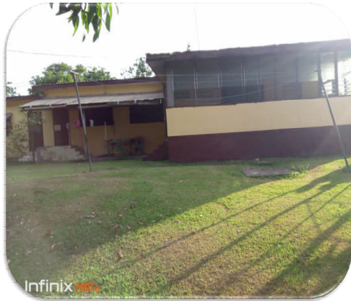
AKIM OFOASE FORMER DMJ HOUSE